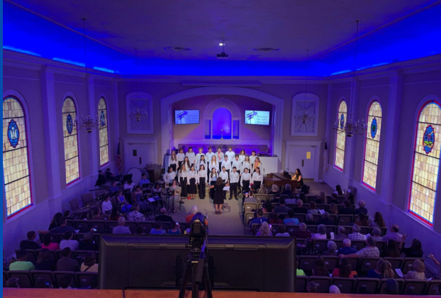
TFAI Choir & Jewel Tones performing at the TFAI spring concert.